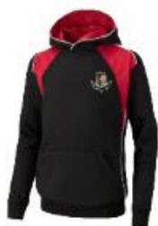
Black hoodie (with/without school badge)