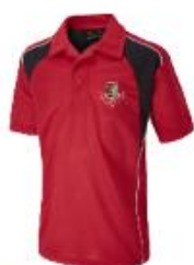
Red polo shirt (with/without school badge)