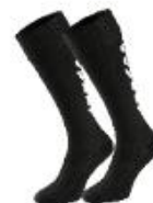
Plain black long socks