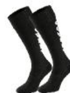
Plain black long socks