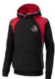
Black hoodie (with/without school badge)