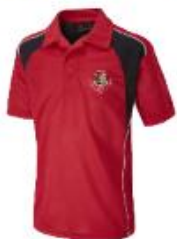
Red polo shirt (with/without school badge)