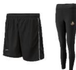
Plain black shorts and/or plain black sports leggings (no logos/designs)