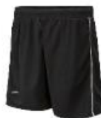
Plain black shorts