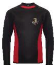
Black rugby top with reversible red flash (with/ without school badge)