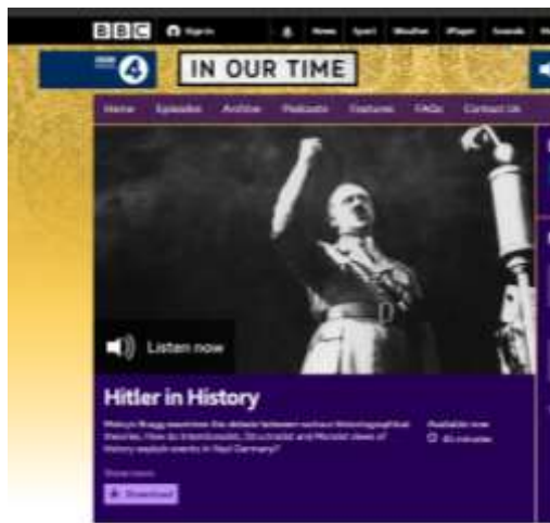
The Rise of Hitler 1929-1934 podcast